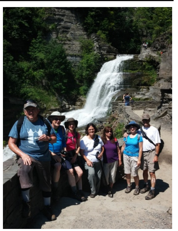
Robert H. Treman State Park.

September 12— Hike in the Village. Due to the inclement weather, only two VHT board members toured around the Village and over to Victor Municipal Park. But in spite of the weather, VHT was at Hang Around Victor Day and talked to many people about our trails.