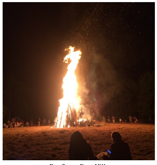
Bonfire at Bare Hill.