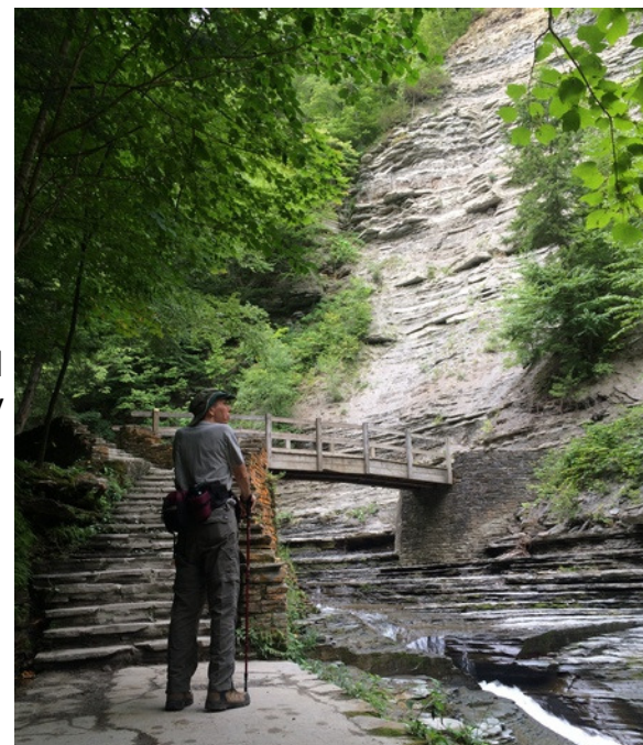
Jeff Hennick at Stony Brook State Park.

but with a temperature of 58 degrees, no one was that anxious to jump in. Anita stayed to do some extra hiking and did go in, but only for a very short time.